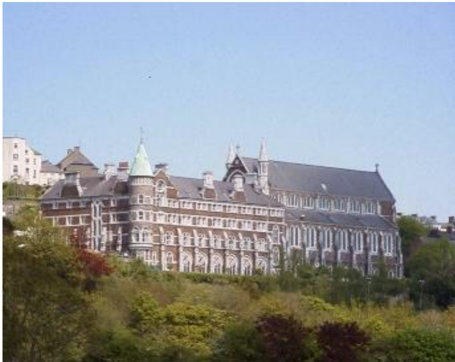
The Department of Music, above the River Lee

The Department of Music at UCC is committed to the cultivation – through creativity in teaching, research, composition and performance – of a dynamic learning community dedicated to an interdisciplinary and cross-cultural understanding of music