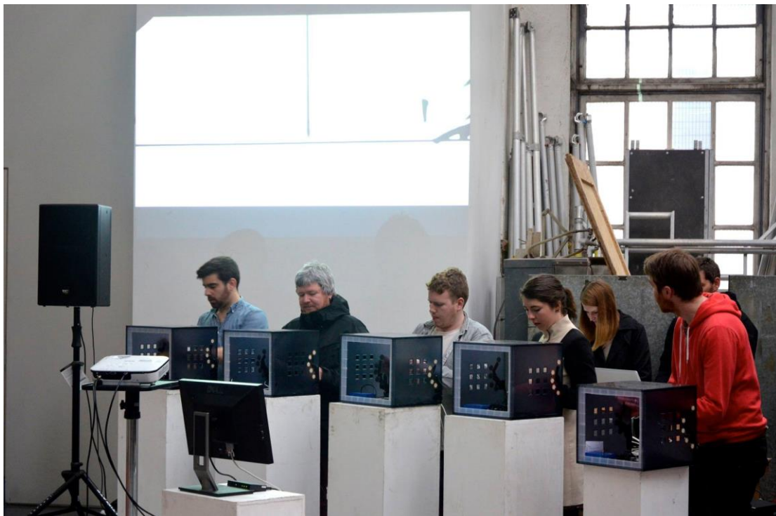
Undergraduate and postgraduate students take part in CAVE (Cork Audio Visual Ensemble, a live interactive digital music performance group)

Further details on the BA: http://www.ucc.ie/en/ck104/