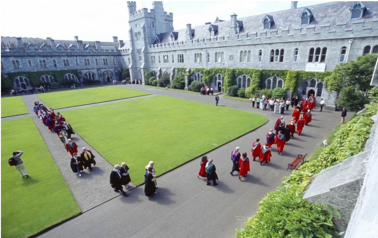
The Main Quadrangle