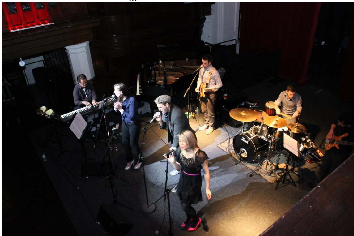
Student Performance at Cork's Triskell Arts Centre

There are additionally a number of staff in Music and in UCC more widely with an established interest in musicology.