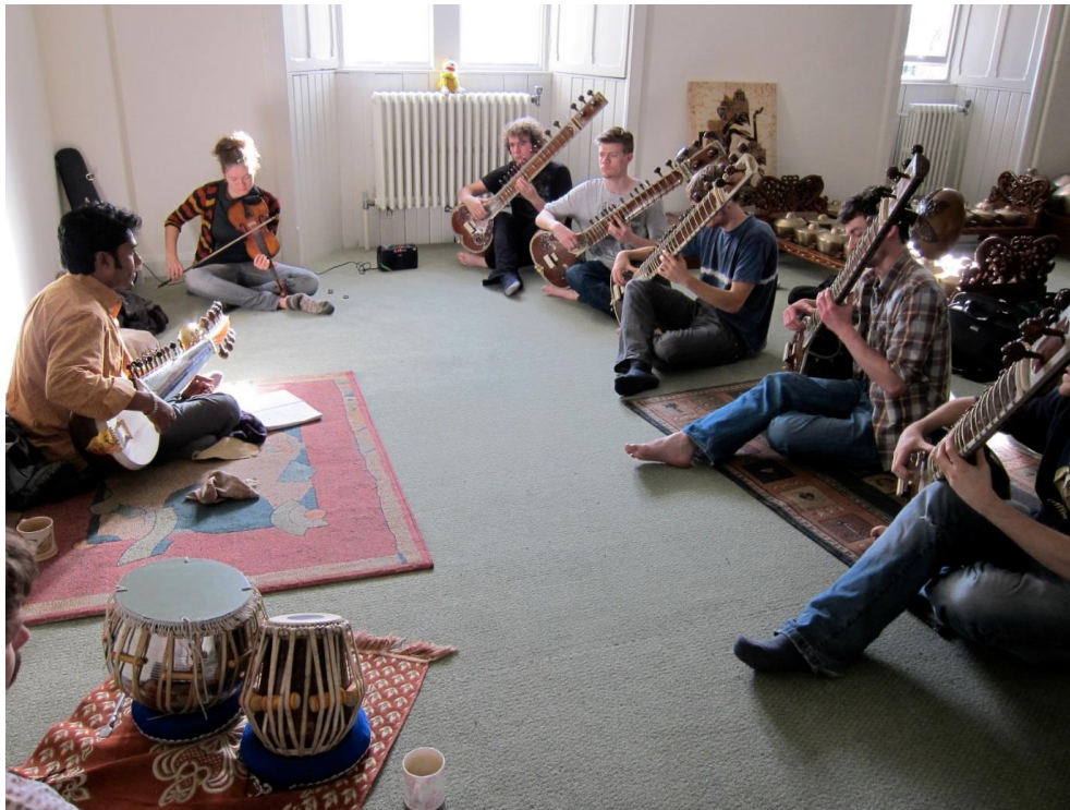
Indian Music Workshop

Activities initiated within the Department have meanwhile spread into the community. Excellent recent examples include the rise of a Sacred Harp singing tradition, which developed out of classes first initiated inside the Department, and the creation of Cork Community Gamelan, commissioned by Music Generation in partnership with UCC Music Department. Staff and students are engaged with Cork's unique Sound Art and Improvisation scheme. Staff also work closely with various national and local organisations including Music Generation, the Arts Council, the Higher Education Authority, Cork City and County Councils and various traditional music institutions.