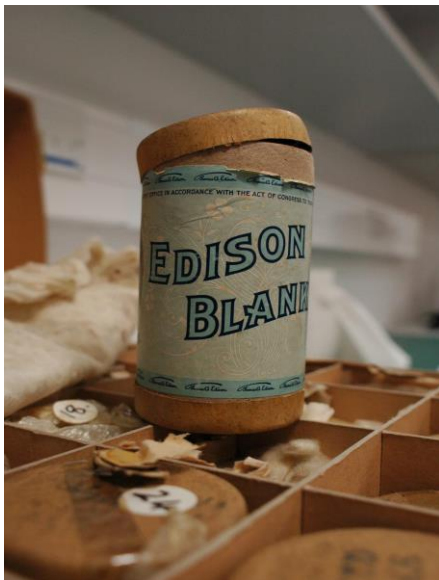
From the Henebry / O'Neill collection of wax cylinders

The Department is host to two archives, one dedicated to traditional music, the other to traditional dance. The Department's Traditional Music Archive houses more than 2,000 items of original field recordings collected over the past 40 years by both students and staff of the Department, plus recordings of concerts and events, plus dissertations, photographs, old instruments and ephemera. It attracts visitors from UCC and from many other institutions. The (privately held) Archive of Traditional Dance offers a rich body materials for those researching Irish dance and its music. Further materials are held in the main library collections. Among these, material from the O'Neill/Henebry digitisation project is now available online.