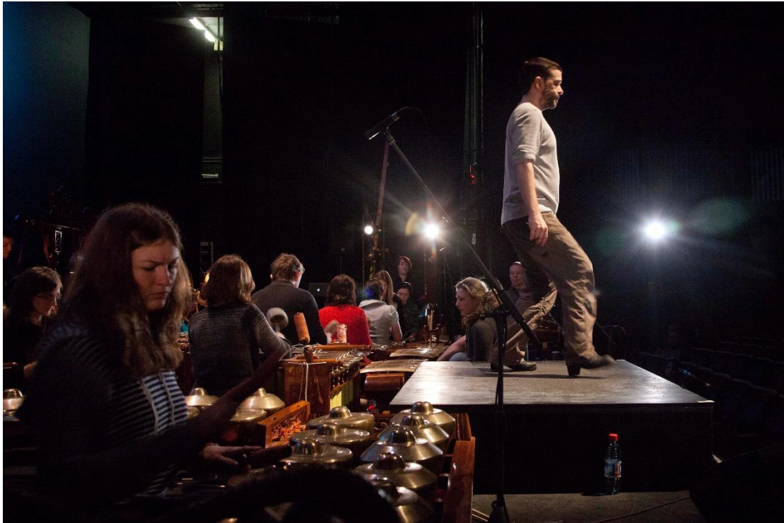
UCC Gamelan rehearses for a performance with Colin Dunne (traditional and modern dancer, currently Traditional Artist in Residence to UCC), in Cork Opera House

The site commands panoramic views over the River Lee, UCC's main campus and much of Cork City. The building includes a small hall which can be used for performances and conferencing, a number of teaching rooms and practice rooms, student computing facilities and a computer music studio. There is a collection of instruments, including some historical keyboards, Irish traditional instruments and Ireland's earliest gamelan, Nyai Sekar Madu Sari (Venerable Flower of Honey Essence, built in 1994), all of which are in regular teaching use. There is a nationally significant archive of Irish traditional music, and the Department also hosts the (privately held) Archive for Irish Traditional Dance.